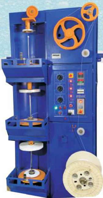
Technical Specifications As Per IS 8783 (Part 4 / sec. 3)

Merchant exporter of submersible winding wire